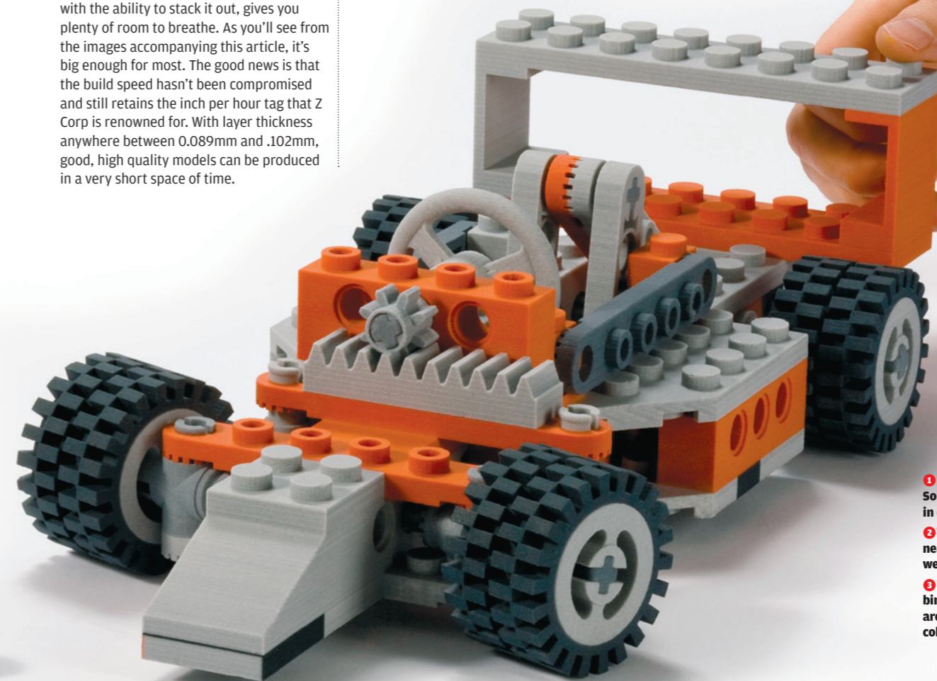
1 Modelled in SolidWorks, printed in one build 2 The ZPrinter 650 is nearly 2m wide and weighs over 300kg 3 With a new black binder, features are more crisp and colours richer

“ Previous Z Corporation 3D printing machines used Cyan, Magenta and Yellow to make up black, so a lot of binder was used and it didn't give the best colour match ”