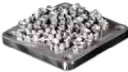
Partials, copings and bridges production in Cobalt Chrome (CoCr)