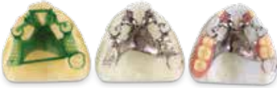
Partials and working models printed on the ProJet MJP 3600 Dental