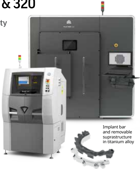
Implant bar and removable suprastructure in titanium alloy