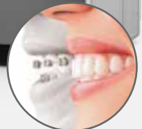
Dental models for thermoformed aligners