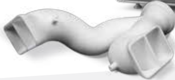
Manifold printed in DuraForm ProX FR1200