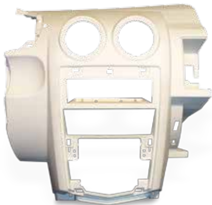
DuraForm PA Dashboard