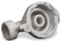
Hose fitting printed in DuraForm ProX GF