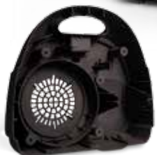
Back cover of vacuum cleaner printed in DuraForm EX Black