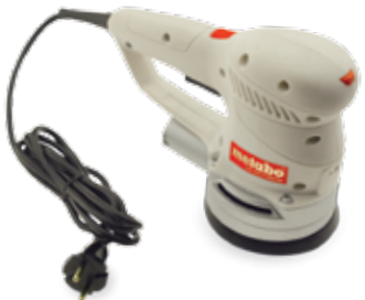
Sander tool housing printed in DuraForm PA material